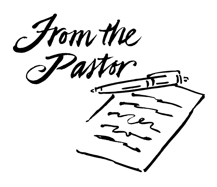
In Mark 1:17, Jesus' invitation and challenge to the Disciples is "Come follow me, and I will make you fishers of men (people)."

What does this mean? One commentator wrote; "Jesus' thoughts on fishing in becoming a fisher of man meant that Jesus was going to use his disciples to grow the kingdom of God." Another wrote: "In other words, you think what you're doing now is good, but if you follow me, I can show you greatness. They were content catching fish. Jesus called them to change lives. There are levels in our lives that God wants to take us too." [sic]